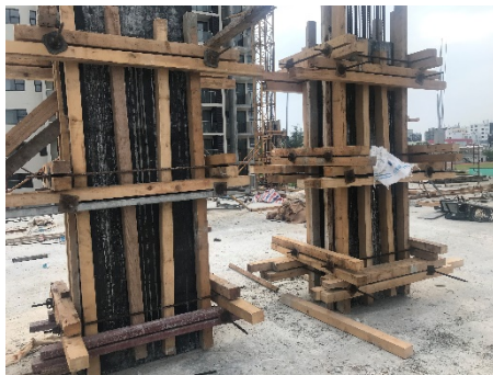
2nd Floor Column Formworks