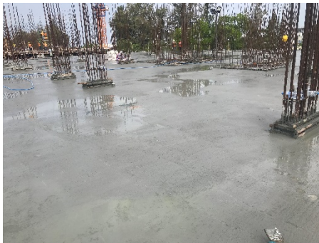
2nd Floor Slab Concrete Casting