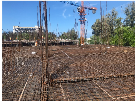
2nd Floor Slab and Beam Reinforcement