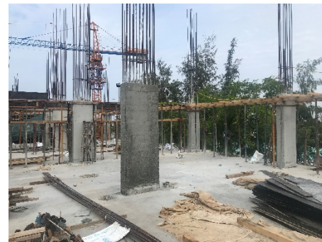
2nd Floor Column Concrete Casting

PREPARED AND SUBMITTED BY GLUT INVESTMENTS PVT. LTD.