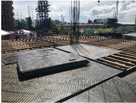
2nd Floor Slab and Beam Formworks