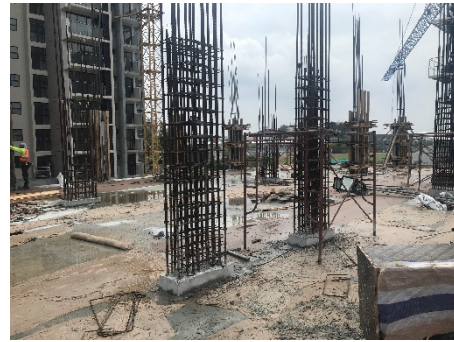
2nd Floor Column Reinforcement