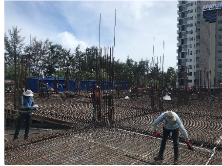
First Floor Slab and Beam Reinforcement