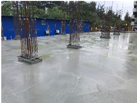
First Floor Concrete Casting