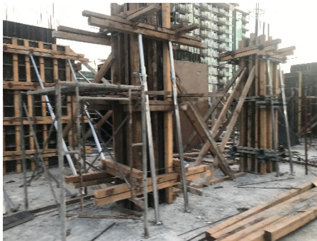
First Floor Column Formworks