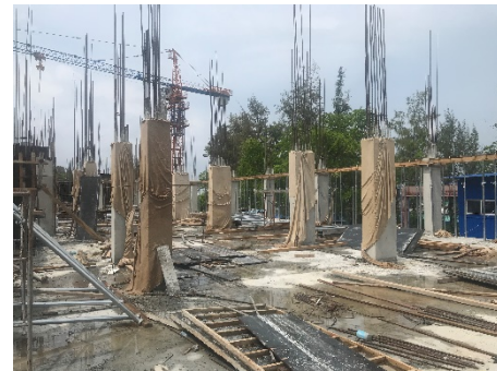
First Floor Column Concrete Casting

PREPARED AND SUBMITTED BY GLUT INVESTMENTS PVT. LTD.