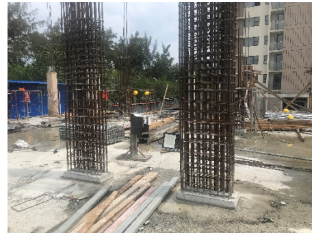
First Floor Column Reinforcement