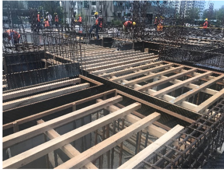
First Floor Slab and Beam Formworks