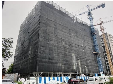
Safety Net Installation