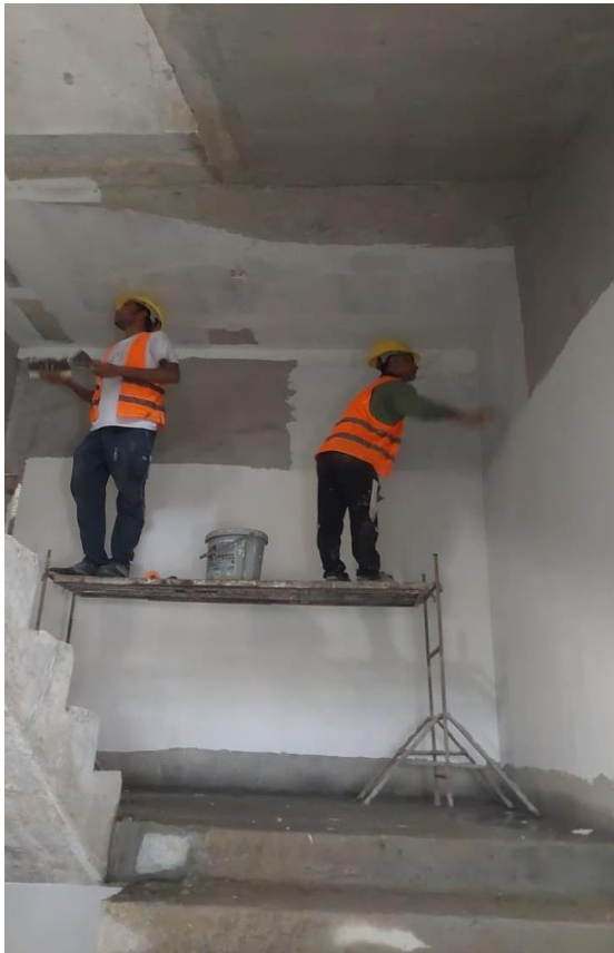
13 th floor staircase area putty work