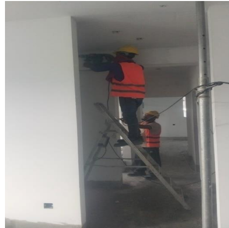
10 th floor Plumbing layout wall cutting