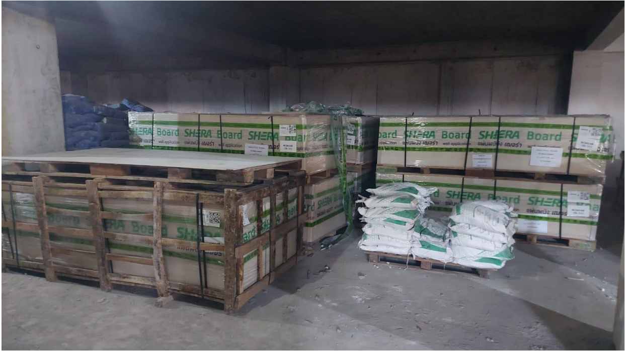
False ceiling material stored at site