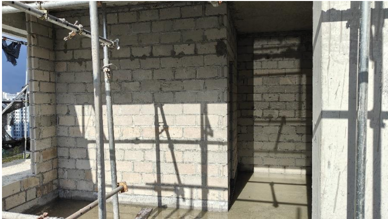
13 th floor block work