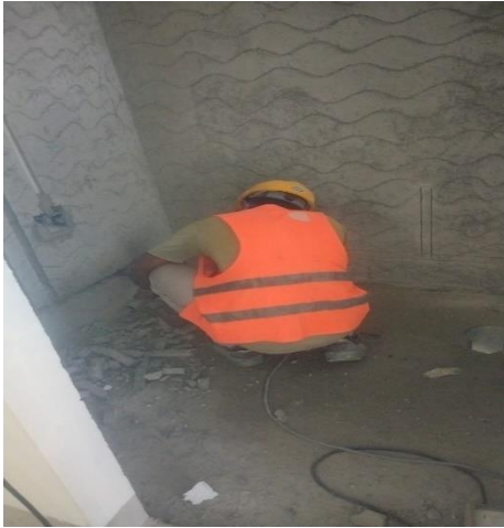
9 th floor plumbing work continuous