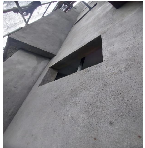
Front elevation D and E ex plastering