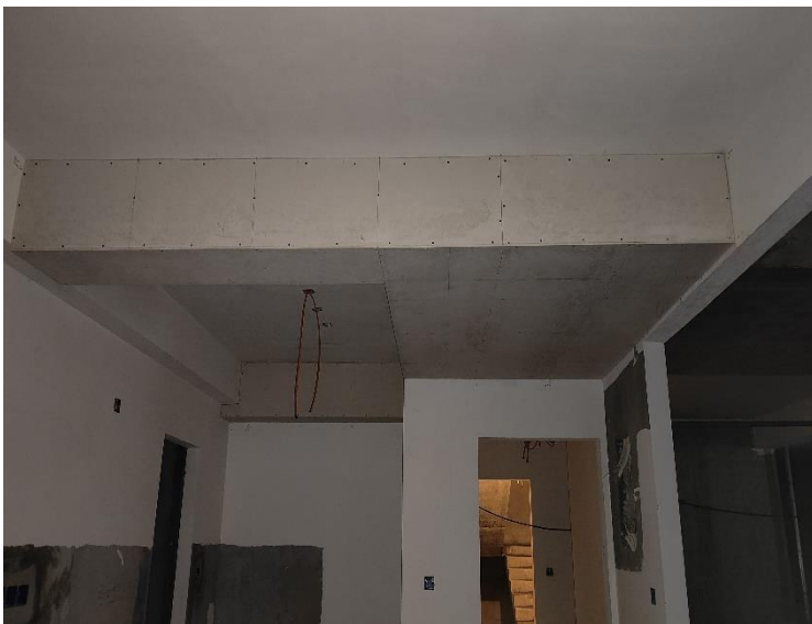
4 th floor ceiling work