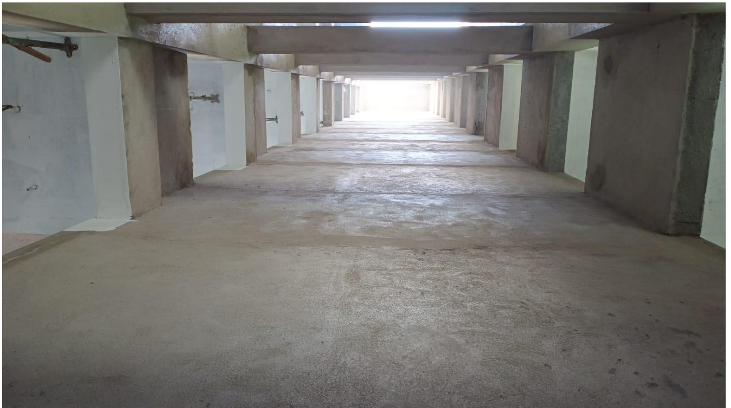
A and J Apartment Air well external plastering