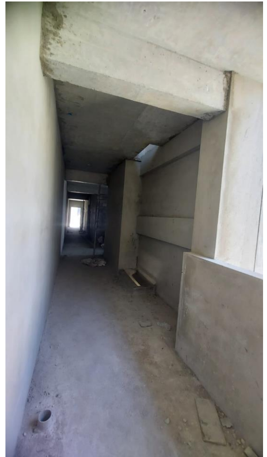
13 th floor plastering work