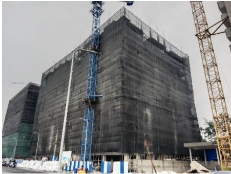
Safety Net installation