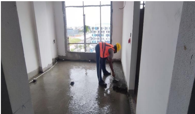
3 rd floor screeding work