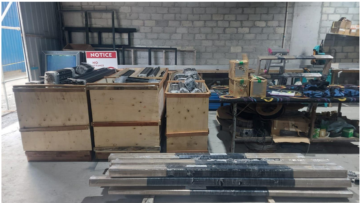
Aluminium Door and Window frame stored at site