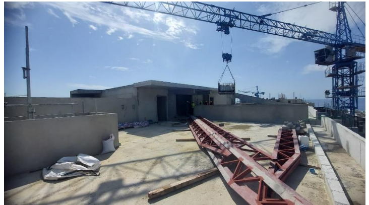
Terrace floor external plastering