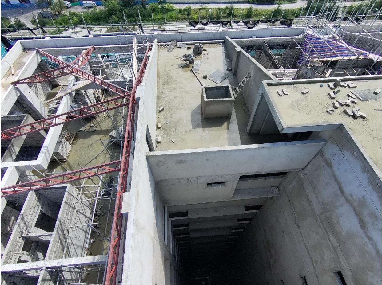
Current roof terrace view

PREPARED AND SUBMITTED BY GLUT INVESTMENTS PVT. LTD.