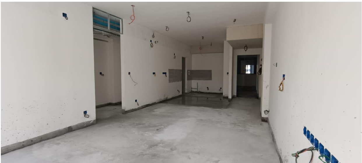
3 rd floor screeding work