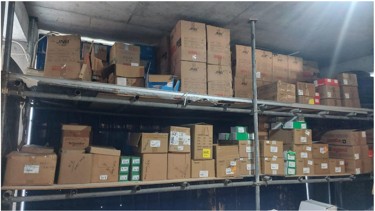
Electrical switches, MCB and fans stored at site