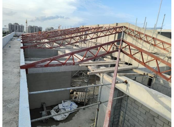
Roof truss erection work