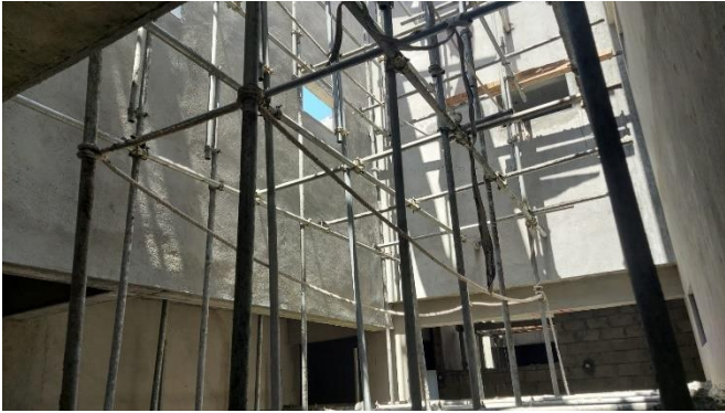
A J air well external plastering