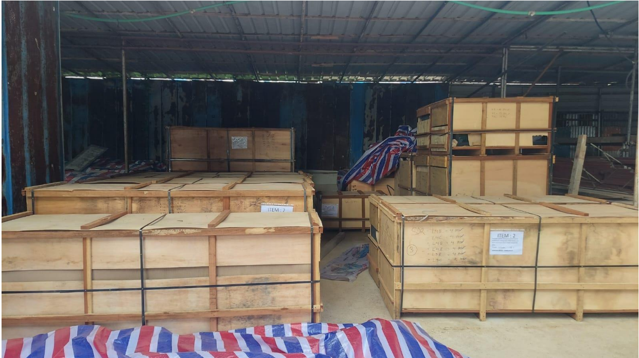
Aluminium door and window leaf with glass stored at site