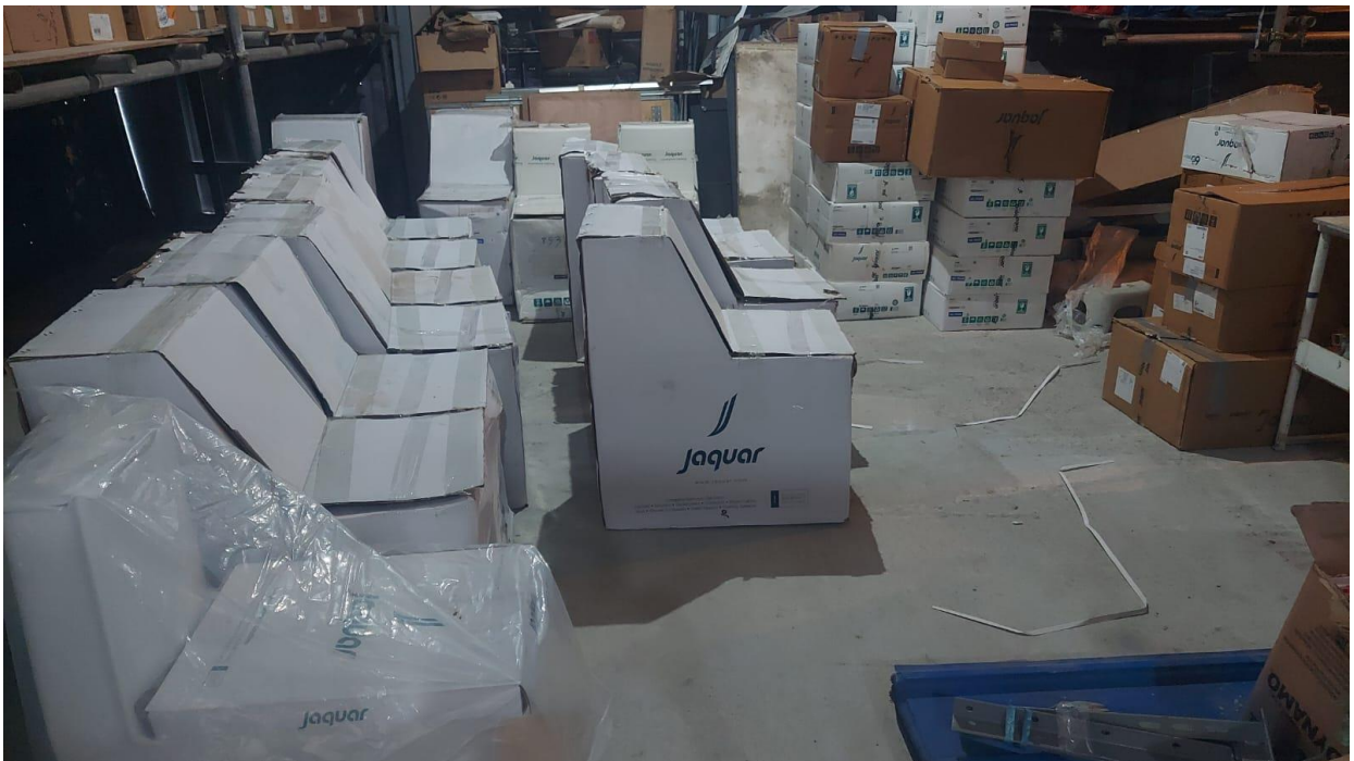
Sanitary items stored at site