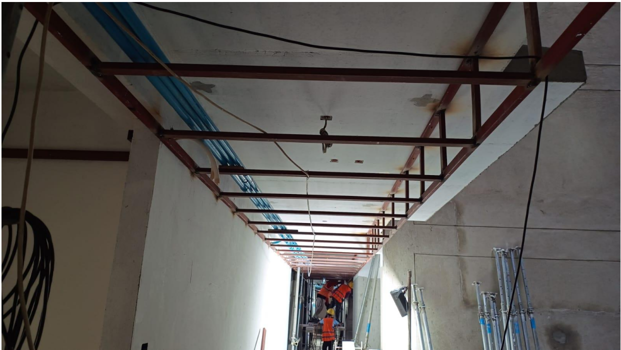
3 rd floor common area ceiling work