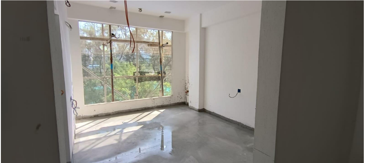
3 rd floor B apartment bedroom screeding