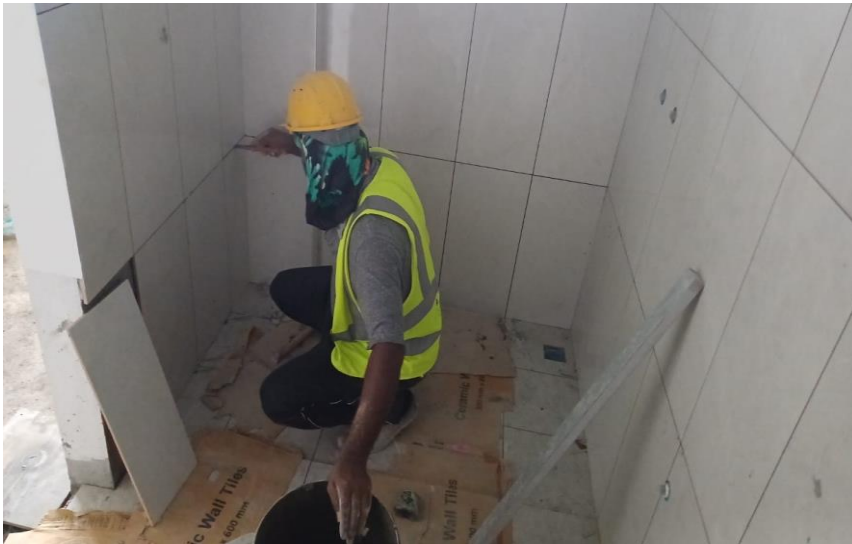
6 th floor tiling work continuous