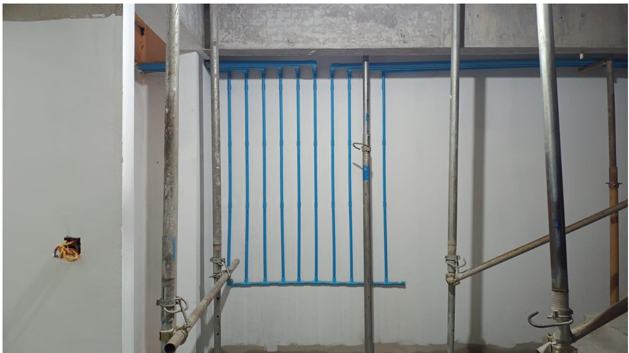
6 th floor fresh water line