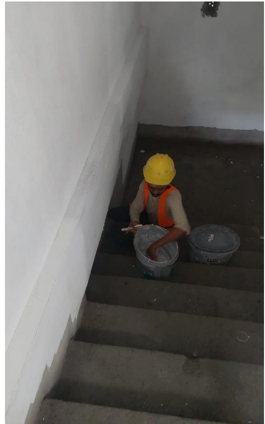
Terrace stair area wall and ceiling putty