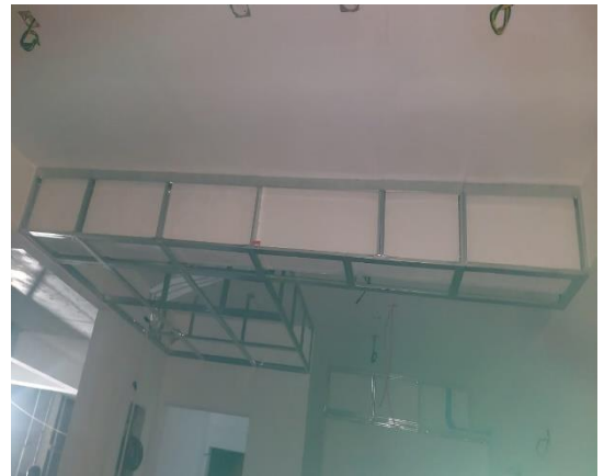
6 th floor ceiling work