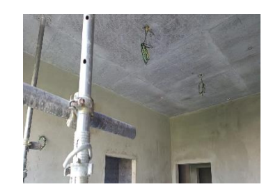
5th floor type C wiring