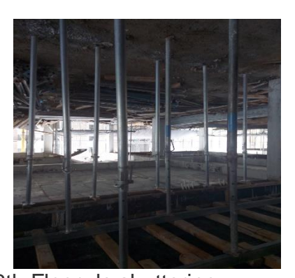
12th Floor de shuttering