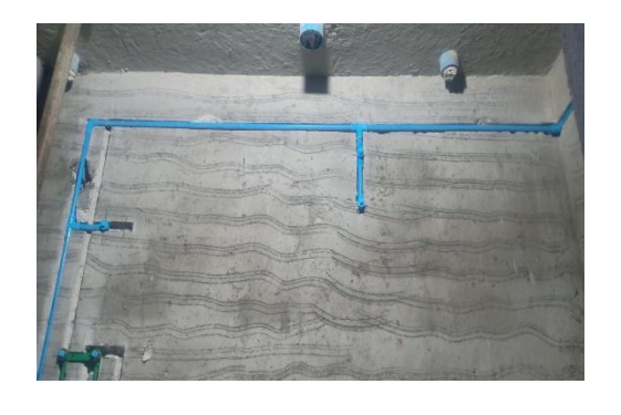
5<sup>th</sup> floor type B plumbing work