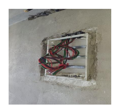
5<sup>th</sup> floor type C wiring work