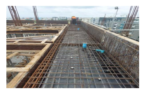
Roof terrace Electrical & Plumbing Sleeve