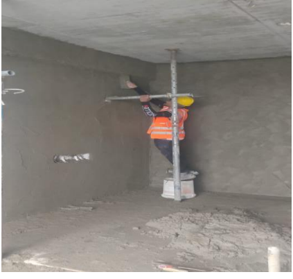
7<sup>th</sup> floor plastering