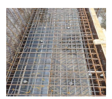
Roof terrace slab Reinforcement