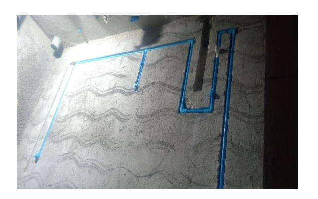
5<sup>th</sup> floor type c plumbing work