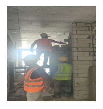
10th Floor Blocks Laying