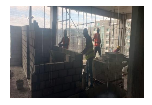
10th floor block works