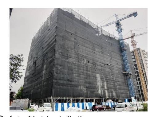
Safety Net Installation