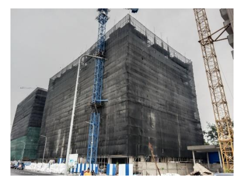
Safety Net installation