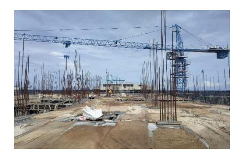
13th Floor Slab Concrete Curing