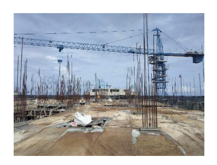
13th Floor Slab Casted.