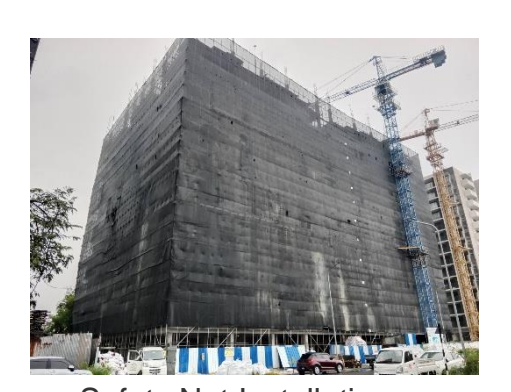
Safety Net Installation