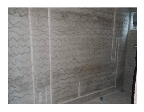
5<sup>th</sup> floor plumbing wall chasing