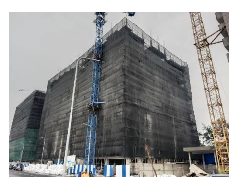
Safety Net installation