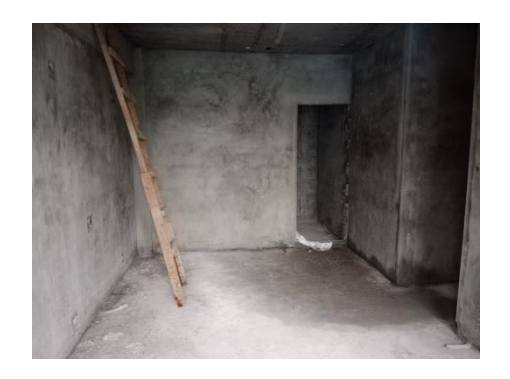
5<sup>th</sup> floor Plastering