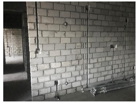
5th Floor Blocks Laying