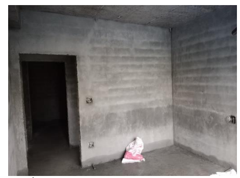
7<sup>th</sup> floor plastering