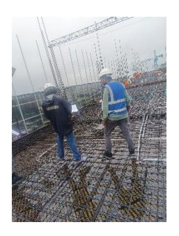
13th Floor Electrical & Plumbing Sleeve