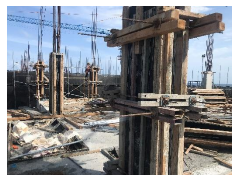
13th Floor Column Formworks