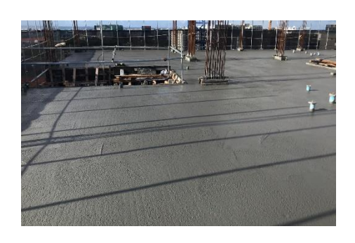
13th Floor slab casting