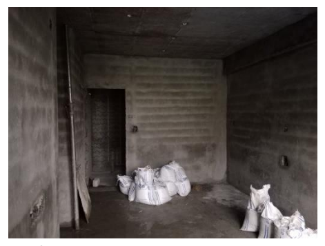
6<sup>th</sup> floor plastering