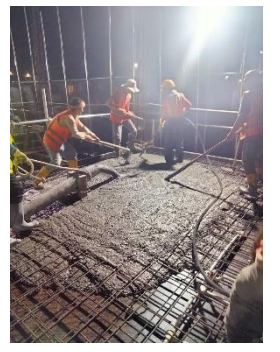
13th Floor Slab casting work