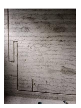
6<sup>th</sup> floor plumbing wall chasing