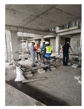
10<sup>th</sup> floor kicker inspection