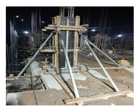
12th Floor Columns Concrete Casting