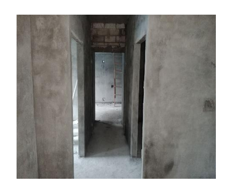
6th floor Plastering

PREPARED AND SUBMITTED BY GLUT INVESTMENTS PVT. LTD.