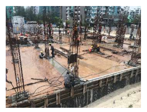
Ground Column Reinforcement