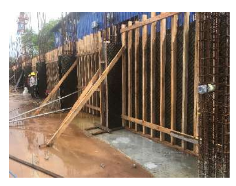
Retaining Wall Formworks