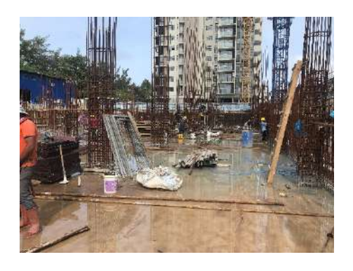
Columns (Below Grd) Reinforcement