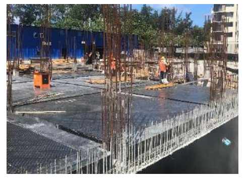
Slab & Beams (Ground) Formworks