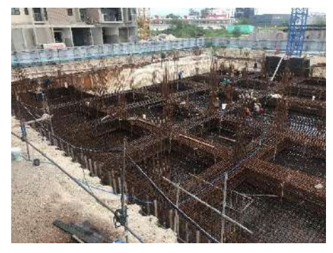
Foundation Beam Reinforcement